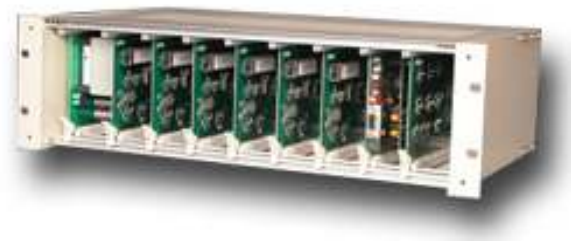
VCL-DX, E1, Drop-Insert, Digital Data Multiplexer

An extensive set of alarms, for easy maintenance are provided in the system.