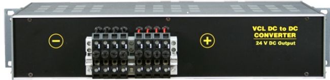
- 48 V DC to 24 V DC Converter

Valiant's DC to DC converter may be used to convert - 48 V DC (range 36 V DC to 76 V DC) Main Input Voltage to 24 V DC output voltage.