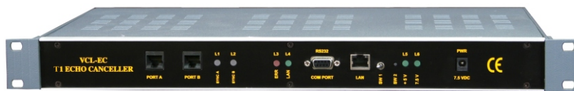
T1 Echo Cancellor 1U (44 mm high) 19 inch Version with Telnet

Valiant offers a compact, robust and cost effective T1 Echo Cancellor solution in 19 inch, 1U high (44mm height) chassis (accommodates 1, T1 Echo Cancellor with telnet, per shelf). Echo cancellation on each channel is 64ms. bidirectional/128ms. unidirectional echo tails - user selectable. T1 Echo Cancellor is also offered and available.