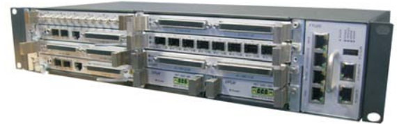
VCL-1400 - 7 Slot