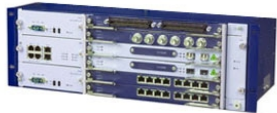
STM-1/4/16 SDH Multiplexer Multi-Services Provisioning Platform

As transmission networks are gradually being dominated by data traffic, VCL100 provides 10/100/1000 Ethernet interface to efficiently carry inter-office data traffic from a corporate LAN, traffic from an ISP, DSL or cable networks.